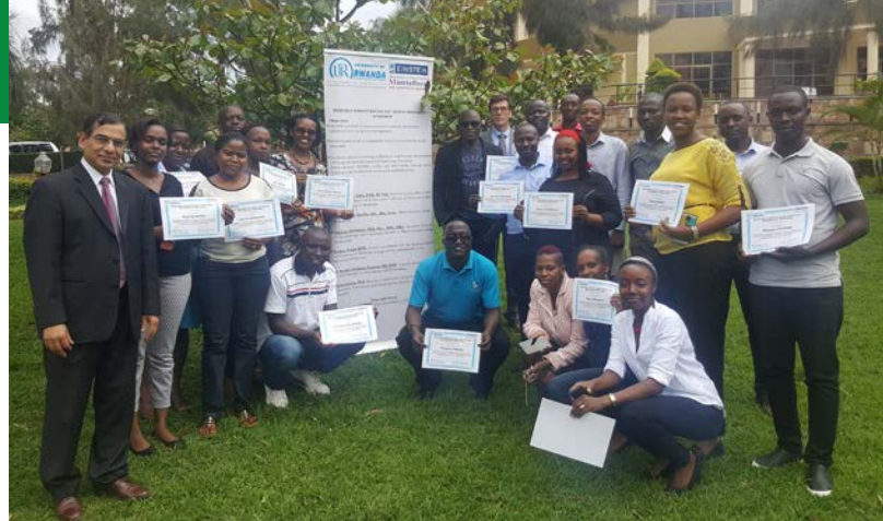
Researchers from the University of Rwanda at a research administration and grants management workshop in Kigali. The Fogarty-funded project focuses on enhancing HIV research training capacity.

However, those who left a lower-income country to study and work in the U.S. or other high-income countries find the balance between "brain drain" and "brain circulation"—or the collaboration of diaspora scientists with those in their country of origin—challenging. They know that while their careers benefited from relocating, the research capacity in their home country may have suffered.