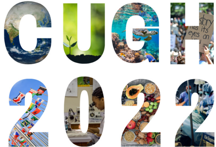
The theme of the 2022 conference was “Healthy People, Healthy Planet, Social Justice”

Corruption tips the scales in favor of the politically connected and the wealthy, noted Madonsela, recalling the looting of pandemic resources in developing nations and the hoarding and exorbitant pricing of vaccines, tests, and treatments in developed nations. “An unexplored ugly side of this competition-driven response to COVID-19 was how African indigenous systems and solutions were dismissed,” added Madonsela, chair of Social Justice at Stellenbosch University, South Africa. Neglect of indigenous knowledge and health resource asymmetries exist far beyond the scope of the pandemic. One-size-fits-all policies persist despite their failure to meet the needs of many.