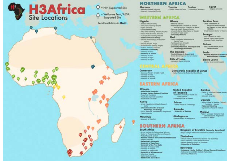
The H3Africa consortium has sites in 30 countries spanning the continent